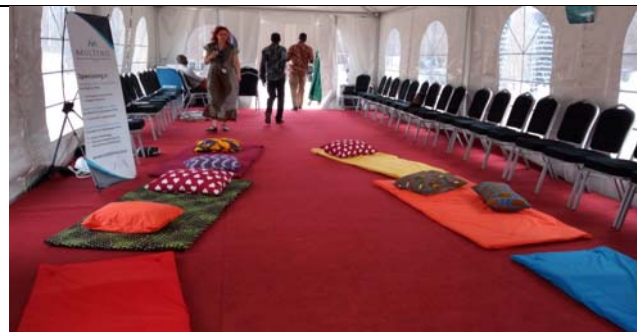
A cosy arrangement of the reading tent