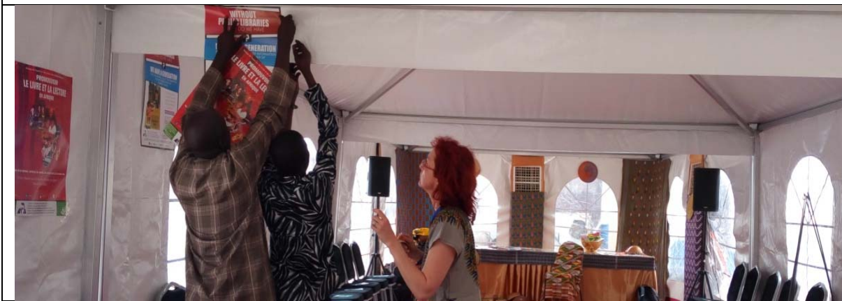
Partners busy teaming up doing final touches of decorations of the reading tent