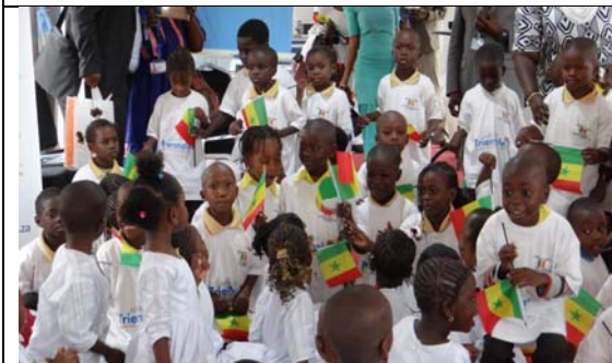
A section of the children at the reading tent