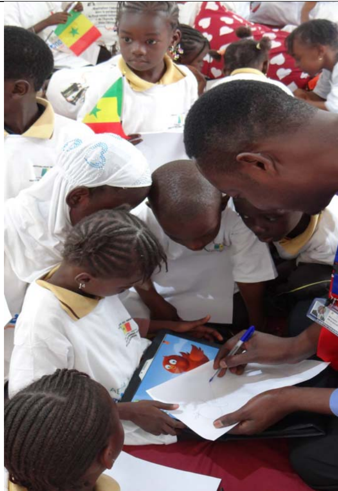
Children getting interested in writing and drawing